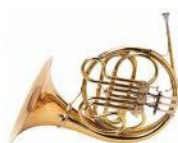
16 French horn